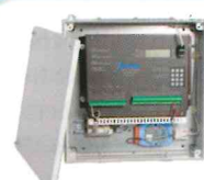
Digital Steering Controls