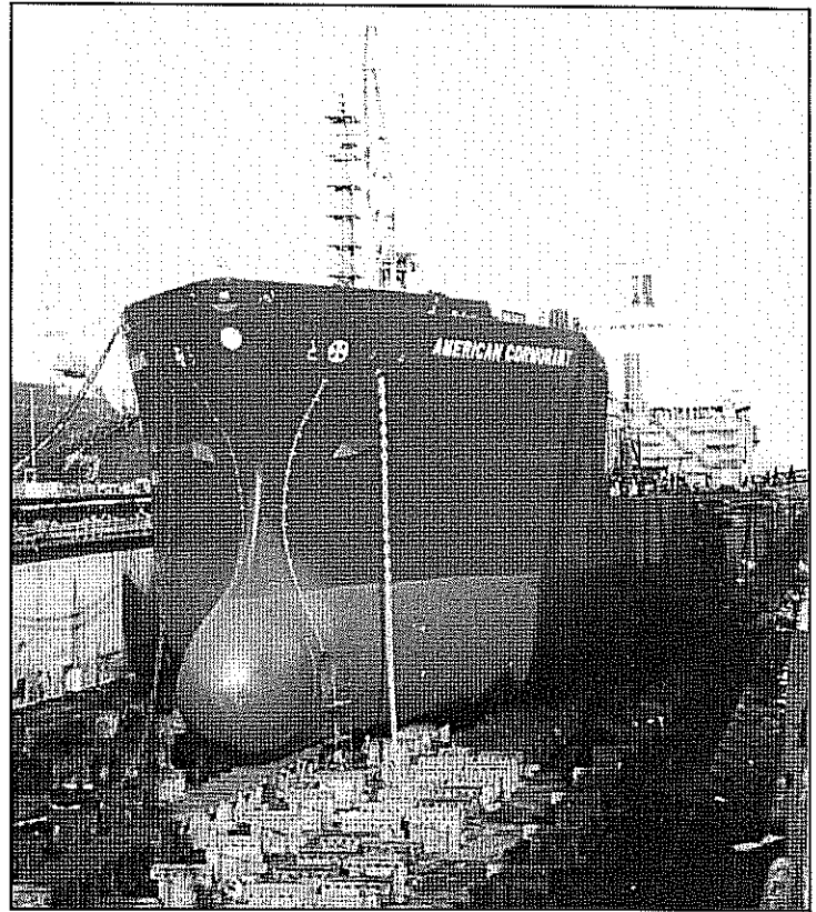
The M/V "AMERICAN CORMORANT" seen on dry dock at Astilleros Espanoles shipyard in Cadiz, Spain where a condition survey was carried out by our firm. She is currently under contract to the Military Sealift Command and is the only heavy lift vessel under the US flag.