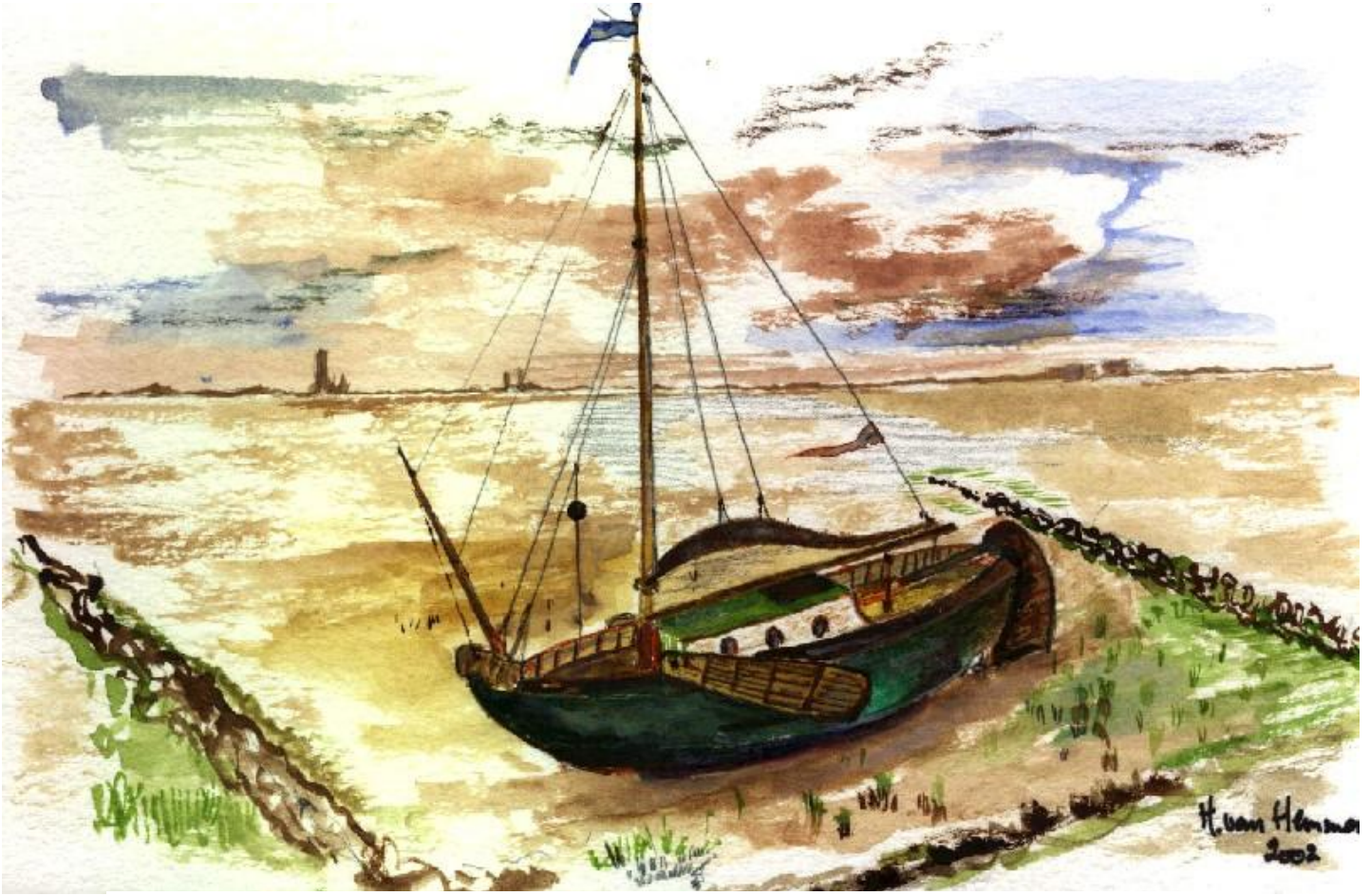
A flat bottom sailing vessel settled at low tide on the mud flat for a night's rest as seen from a dike on an early late summer morning on the Waddenzee (the inland sea of the Dutch West-Frisian Islands)